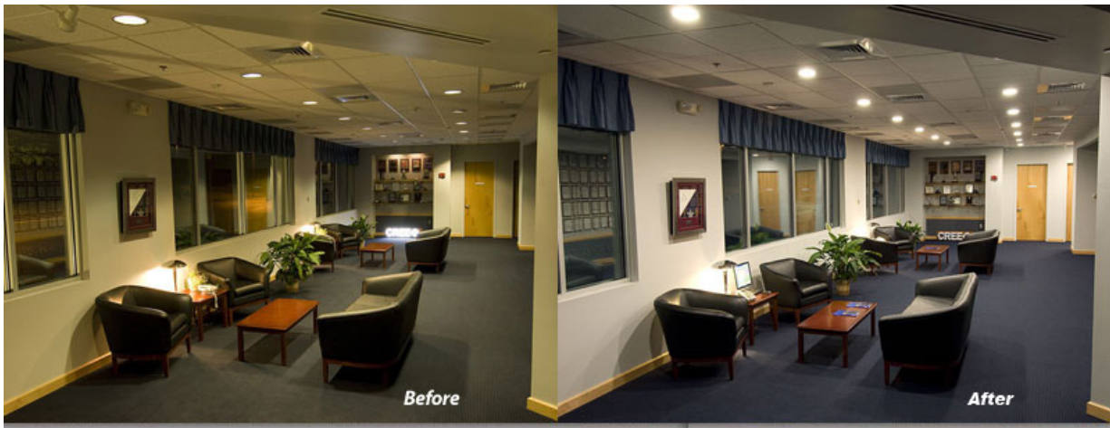
Halogen vs CREE LR6

Traditional, efficient light sources (fluorescent and HID) present a number of challenges with regard to lighting controls. Dimming of commercial (specification)-grade fluorescent systems is readily available and effective, although at a substantial price premium. For CFLs used in residential applications, dimming is more problematic. Unlike incandescent lamps, which are universally dimmable with inexpensive controls, only CFLs with a dimming ballast may be operated on a dimming circuit. Further, CFLs usually do not have a continuous (1% to 100% light output) dimming range like incandescent lights. Often, CFLs will dim down to about 30% of full light output. LEDs may offer potential benefits in terms of controlling light levels (dimming) and color appearance. However, not all LimeLumi LED devices are compatible with all dimmers, so manufacturer guidelines should be followed. As LED driver and control technology continues to evolve, this is expected to be an area of great innovation in lighting. Dimming, color control, and integration with occupancy and photoelectric controls offer potential for increased energy efficiency and user satisfaction.